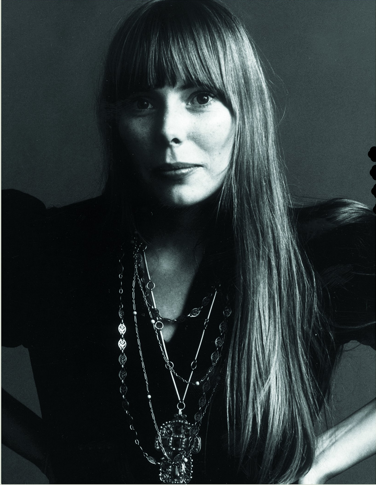
A PORTRAIT OF JONI MITCHELL